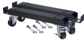
Raises height 4" Heavy-duty channel bar caster set. Add mobility to refrigeration units.