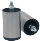
6" stainless steel legs