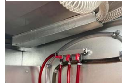
Air Channel Conversion Kit Convert Back Bar to Direct Draw Dispenser